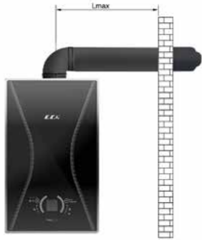
Horizontal Hermetic Flue Application L max. distance with single elbow: 10 m, Ø60/100 L max. distance with single elbow: 20 m, Ø80/125